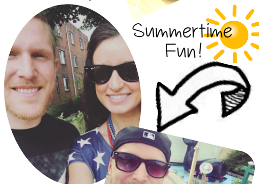
Summertime Fun! ☀️