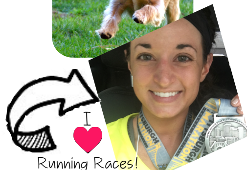
I ❤️ Running Races!